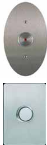
Figure 3: Hall Call

In the event of a building power failure, the door system is provided with a temporary power back-up system to continue the opening operation for a number of times. On resuming normal building power, the back-up system will turn OFF and begin automatic recharging.