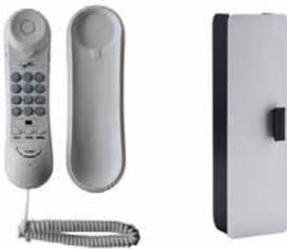
Figure 2: Standard Phone and Phone Box

If the unit has a standard phone, it is located in the cab phone box (see below).