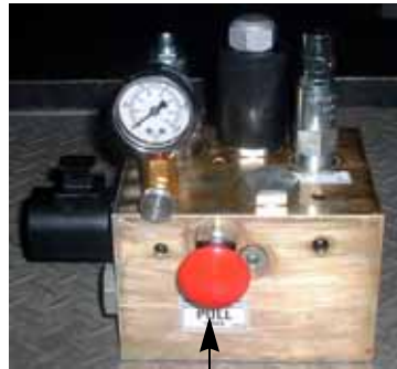
Manual release knob (pull to lower cab)