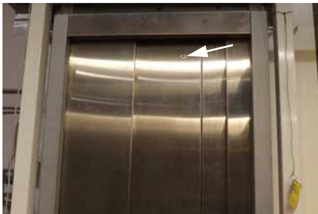
Figure 4: Auto Slim Landing Doors Emergency Opening

When power is turned back on, the elevator will go to the lower landing to relearn the doors.