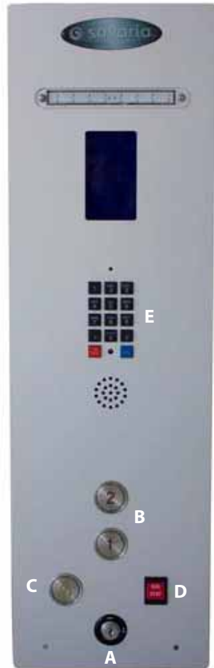
Figure 1: Sample COP

This button can be used at any time to stop the cab and activate the alarm buzzer.